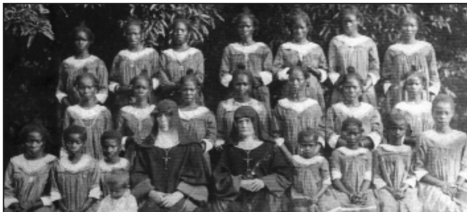
Sisters and pupils at St Joseph's Freetown, early twentieth century