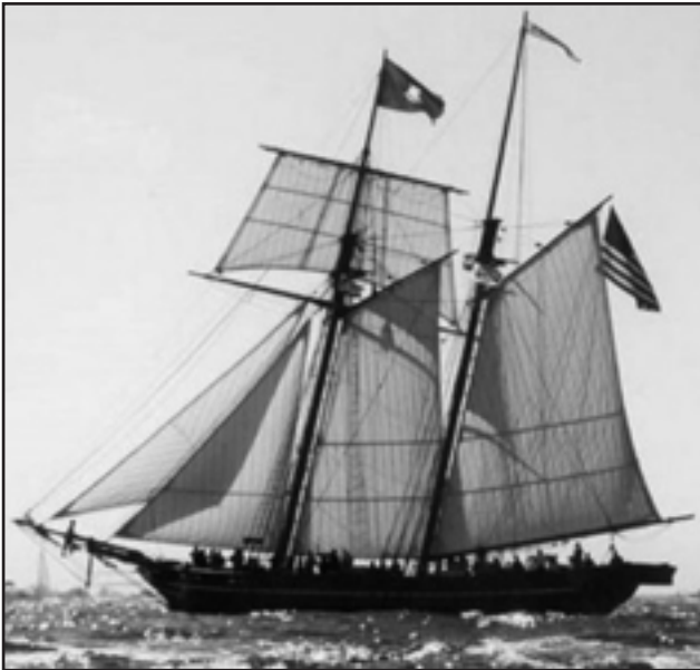
Slave ship Arnistad off the West African coast