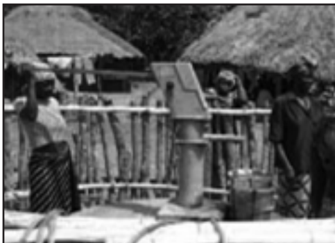
Concern installed water-pump Tonkolili

been away from emergency assistance to rehabilitation with an initial education project providing teaching and learning materials to schools in Eastern Freetown, followed by health projects in Mabella slum in Central Freetown and Kent (Western Area). Since the end of the civil war Concern's programmes have changed from a short term project approach to a longer term more sustainable programmatic approach. Concern's team consists of approximately 150 staff, mainly Sierra Leoneans but with a cosmopolitan membership as well, several members of whom are Irish.