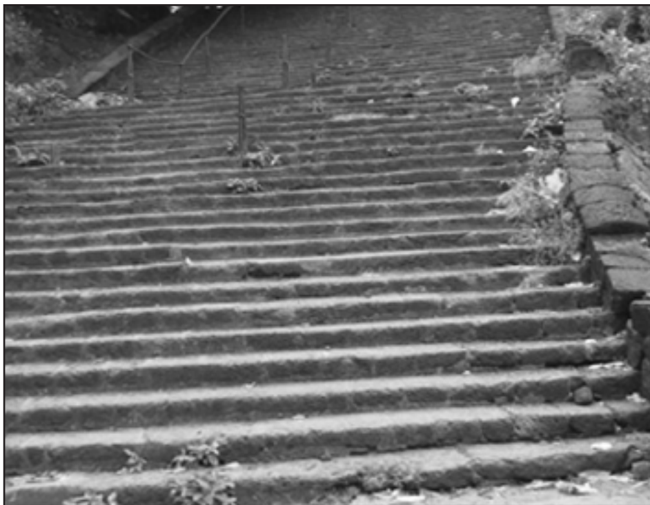
Government Wharf or 'Portuguese' steps built during MacCarthy's governorship

Britain's possessions on the Gold Coast, today Ghana. There, in 1823, following disagreements between the Fantis and the Ashantis, MacCarthy declared war on the latter. In the ensuing hostilities MacCarthy's forces were overwhelmed by the Ashanti army and he was killed.