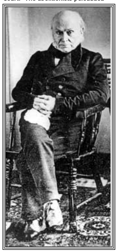
John Quincy Adams, at age 73 and then a former President of the United States, came out of retirement to speak on behalf of the "Amistads" before the U.S. Supreme Court.

he Amistad Committee recognized the need for a public figure of the highest standing to plead the cause of the African captives before the United States Supreme Court. The abolitionists persuaded